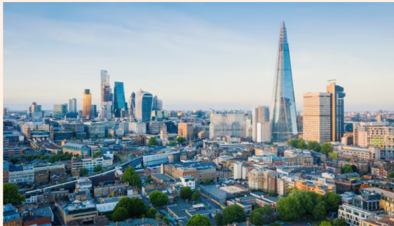
Carry on London: the UK capital keeps its lead for the seventh consecutive year